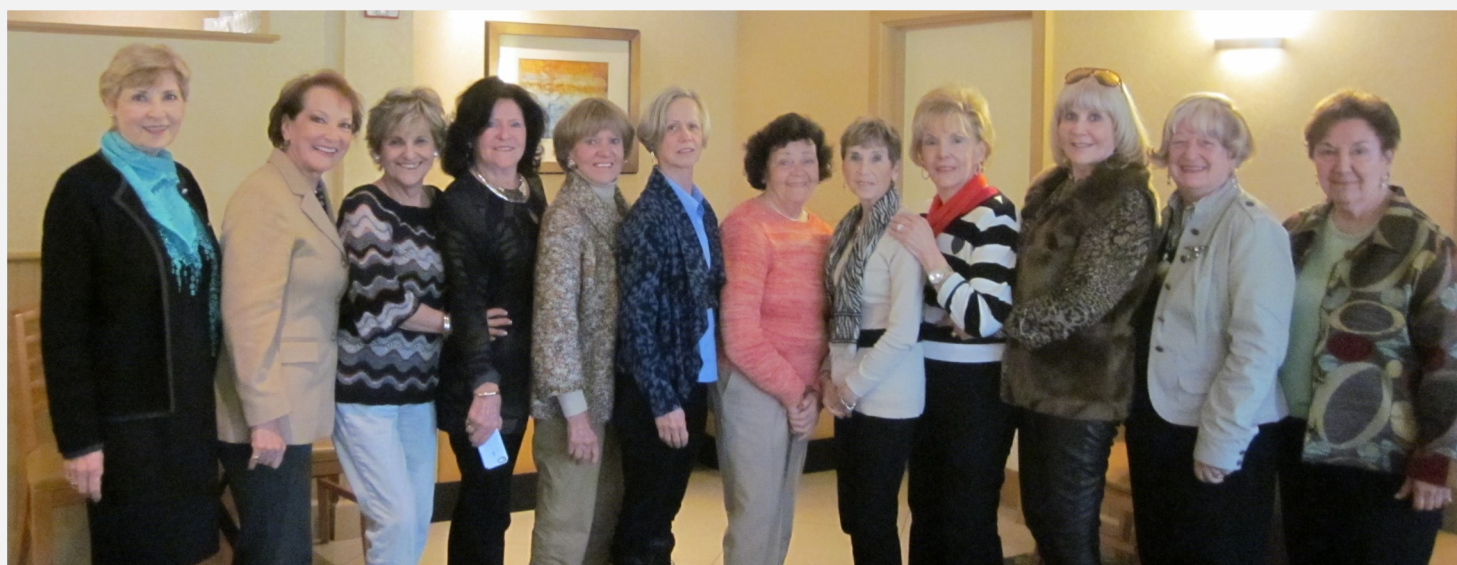
CCC-5 luncheon at the Marriott Hotel in Newton, MA October, 2013.