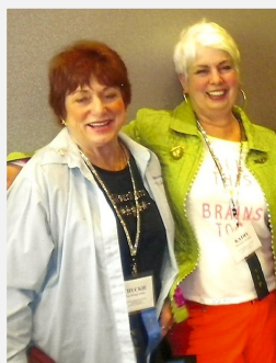
Left during a break in one of the convention meetings.